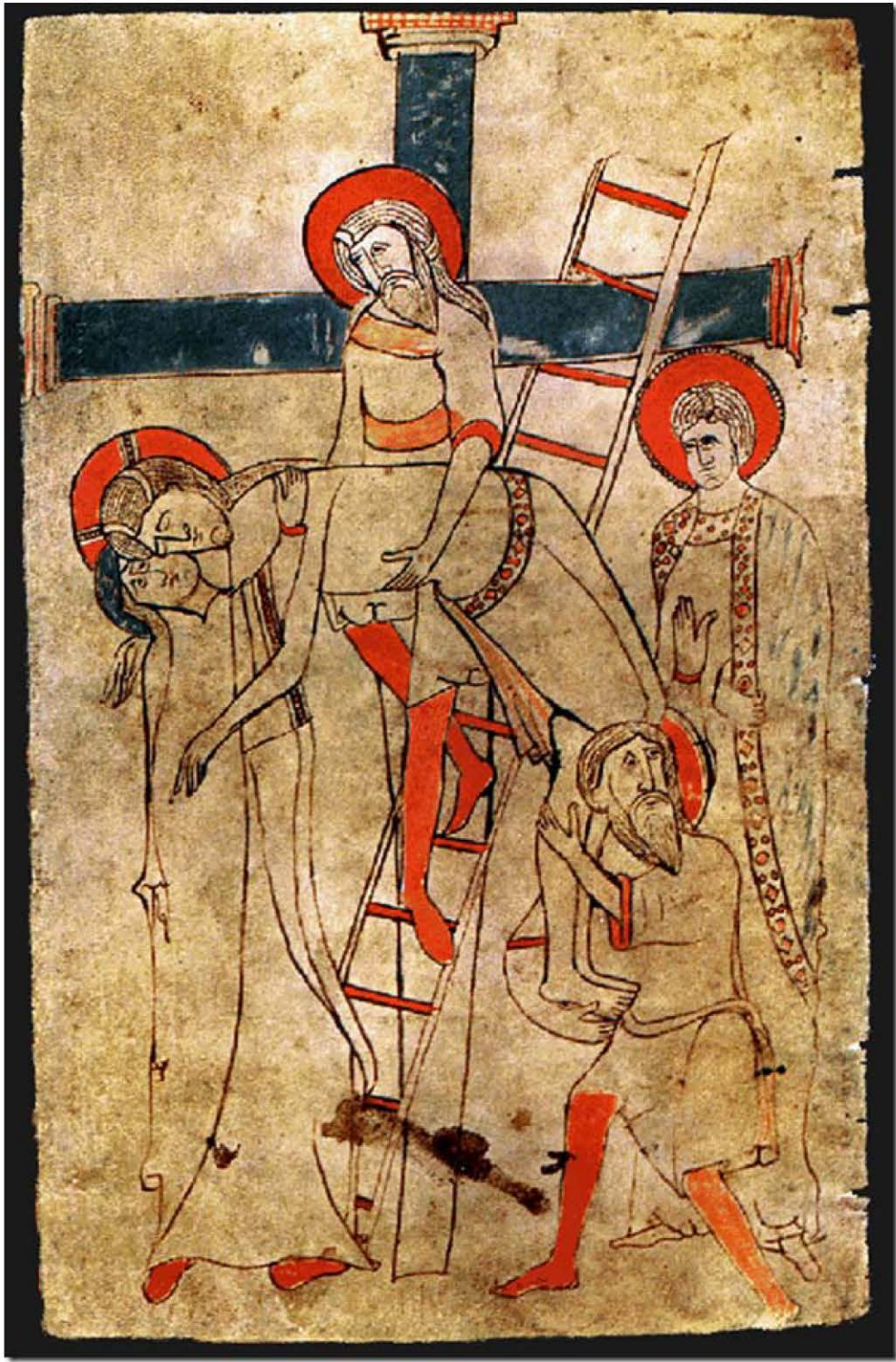
Second illustration in the Hungarian Pray Manuscript (or Pray Codex) as seen in the National Széchenyi Library of Budapest. Named after György Pray who studied it in the late 1700s.